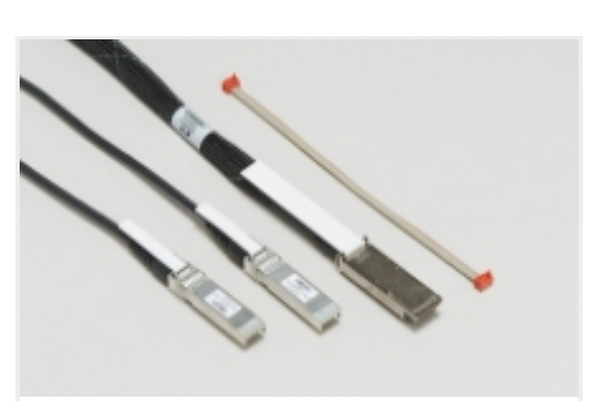
Pluggable I/O Cable Assemblies(52)