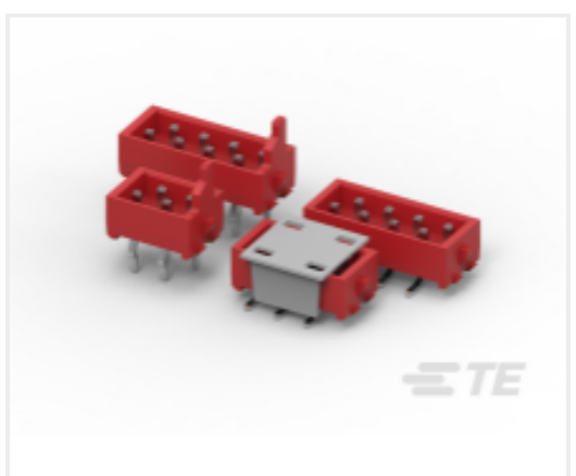
TE Part # CAT-M5833-M2934 Male-on-Board Connector, MicroMaTch