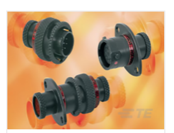
TE Part #ASDD610-23PN PLUG ASSY 10-23 AS DOUBLE DENSITY