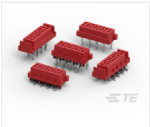
TE Part #CAT-M5833-F3492A Female-on-Board Connector, Top Entry